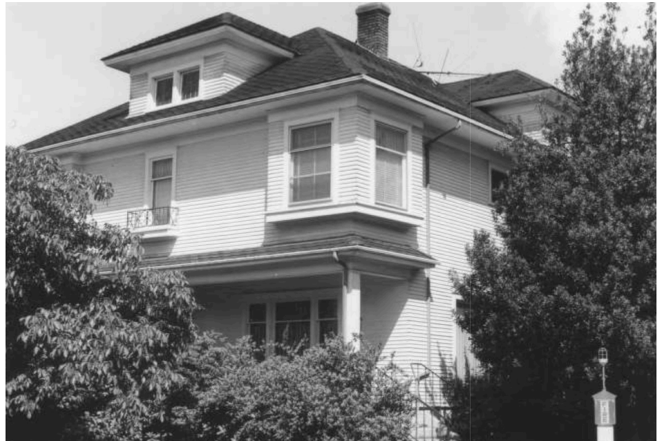
1721 N STEELE ST, c. 1977