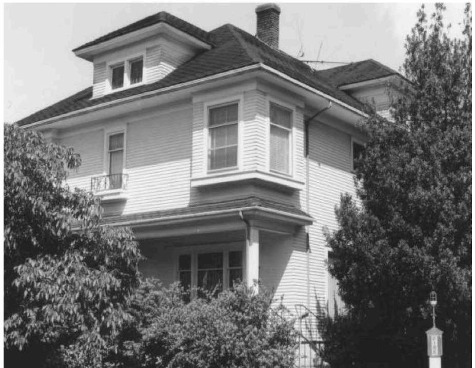
1721 N STEELE ST, c. 1977

He went on to act as district Commissioner for the scouts and was awarded the Silver Beaver Award, as well as the American Legion's Meritorious Service Award for his activities in support of the Boy Scouts.