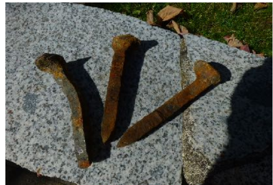
Rail spikes are 5 5/8 long

As the crew replacing the sewer reached N. K St. they came across another reminder of the past - rail spikes from the North K Street Trolley Line that ran out to UPS. They were found in the dirt beneath the old road surface, an historic reminder that before the private car dominated our streets, public rail transportation was available in the NSHD.