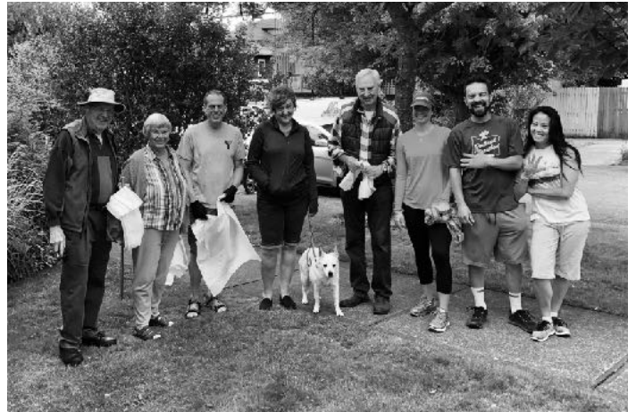
FIRST PLOGGING GROUP

Join Us Nov. 17th 9 am NSHD Park, N. 8th and N. K St.