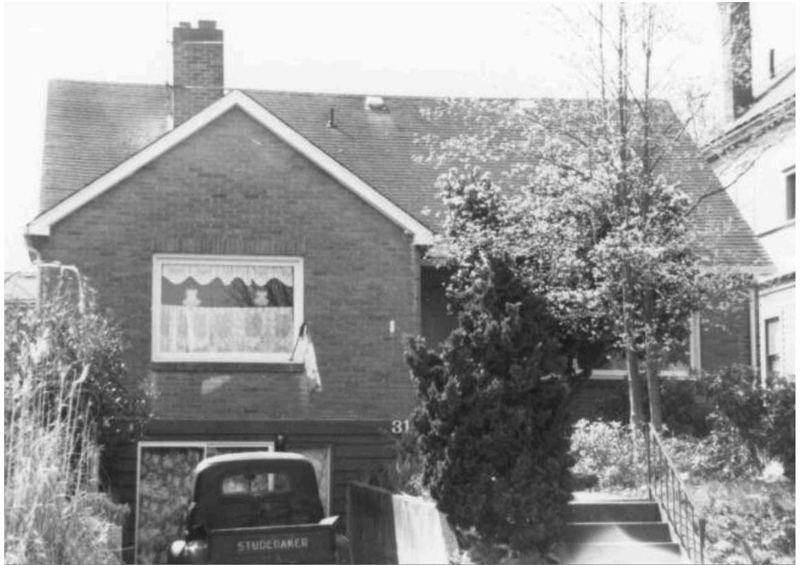
314 N I St c. 1996