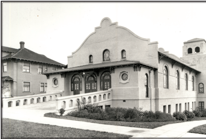
Tacoma Public Library, BU-11524

The Mission-styled Immanuel Presbyterian Church was designed in 1908 by architect Ambrose Russell. Organized in Old Town in 1888, the church was originally called 2nd Presbyterian. The name changed to Immanuel in 1892 and the present building was constructed in 1909 following a fire. The sanctuary showcases a number of beautiful stained glass windows. The church school building was added in 1929.