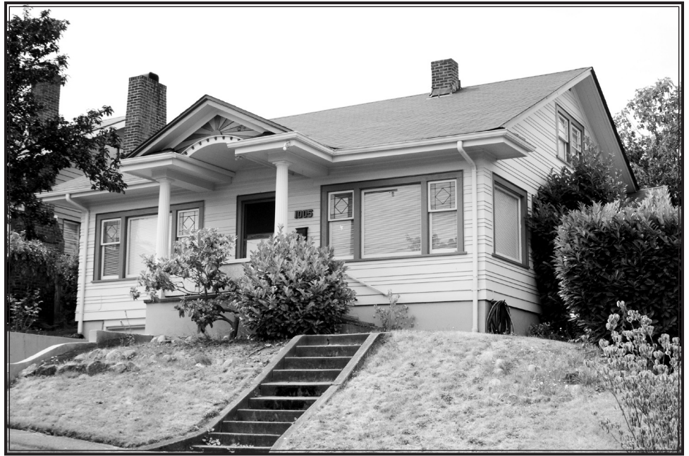
1005 North 9th Street