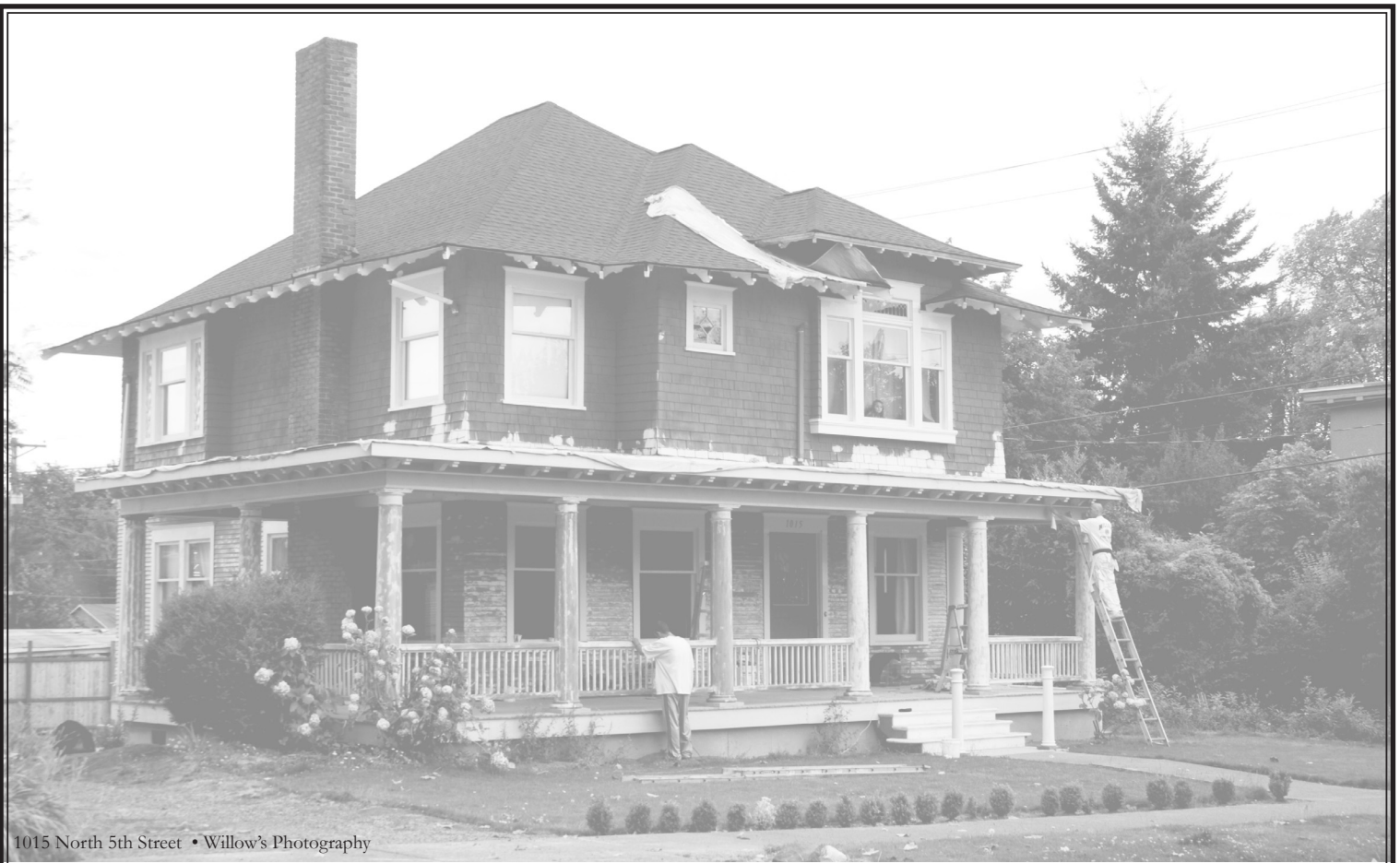
1015 North 5th Street • Willow's Photography