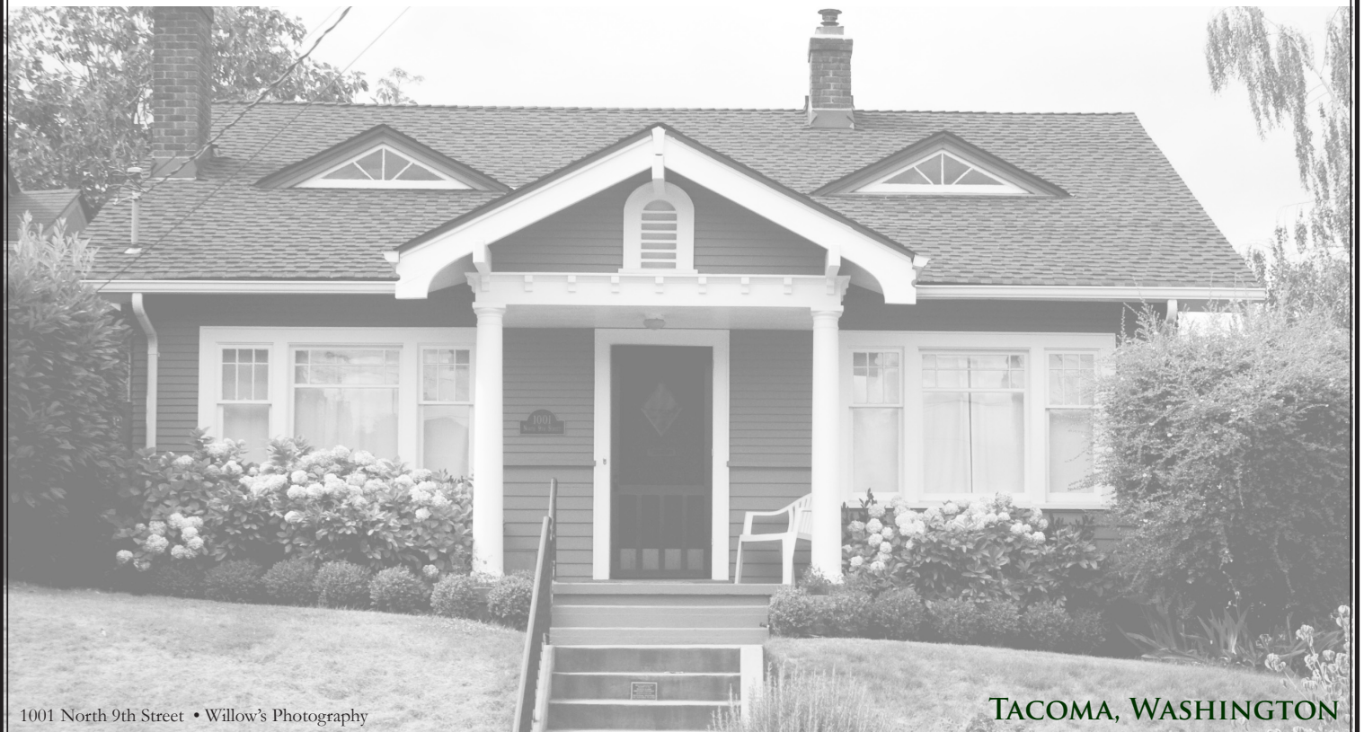
1001 North 9th Street • Willow's Photography