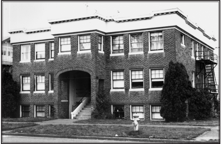
901 North M Street •