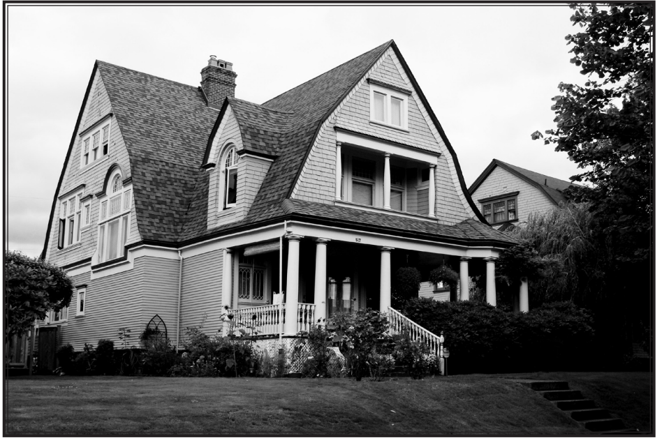
517 North Sheridan Street •