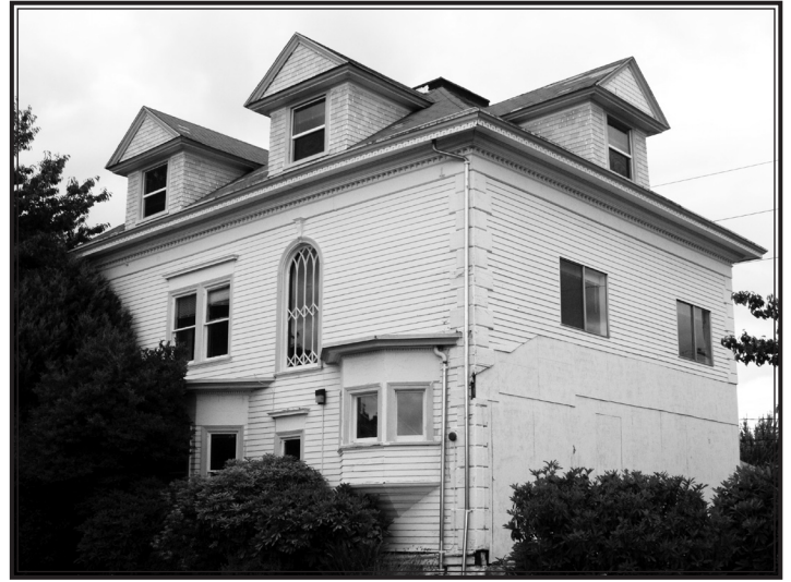
1401 North 5th Street