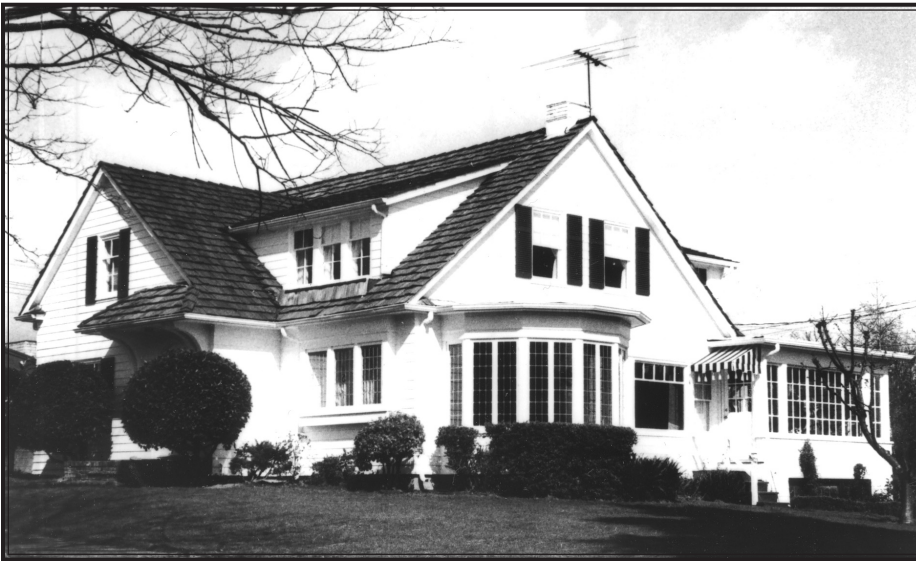
Tacoma Public Library, BU-1141